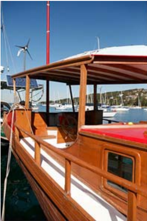
Pictured: the Chinese Junk

If you want to be part of this project you can expect to: Have a lot of fun, Meet new people from across the Shire community, Develop skills in photography, multi media and music/electronic and Be part of a major work presented in a major Australian arts festival.