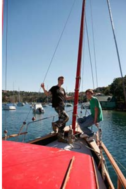
Pictured: On the Chinese Junk

The Event: At dusk every night from 1 December to 31 January around the foreshores of Port Hacking, Botany Bay, Pittwater and Broken Bay, residents, pedestrians, Sydney Festival goers, picnic groups etc, will witness a strange and beautiful site. A Chinese Junk will glide slowly by illuminated up like a ghost ship. Projected onto its three sails will be a series of images and portraits of people who visit or live in the Sutherland Shire. Strange music and sound-scapes will waft from its open portholes and decks, capturing the sounds of different cultures through electronica and live performance. Shot in both colour and black and white, utilizing both still and moving image, the project will create a beautiful picture, which is arresting to watch and thought provoking.