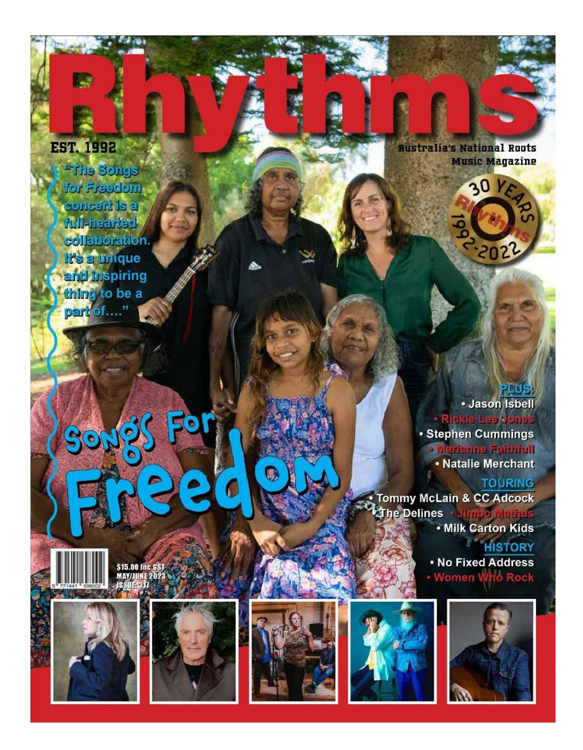
Click image to read the 5-page Songs For Freedom feature in the latest issue of Rhythms magazine